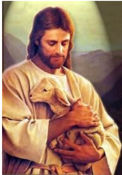
Mom knew that her prayers for me had been answered.