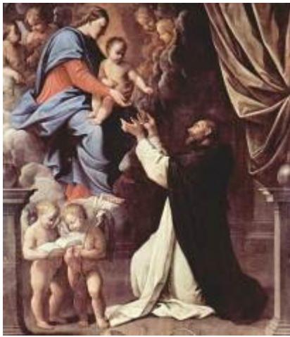
Our Lady Gives St. Dominic the Rosary

The 'Respect Life, Rosary and Letters to America' Issue